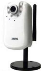
CMOS Wi Fi 5 LED