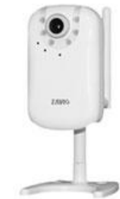
CMOS Wi Fi 5 LED 1.3 Mega Pixel