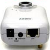
Camera Rear View

The Zavio is an ultra-compact IP camera and ideal for surveillance of homes, offices, and retail shops. 6 high power LEDs enable it to work well in poor lighting conditions, even in complete darkness.